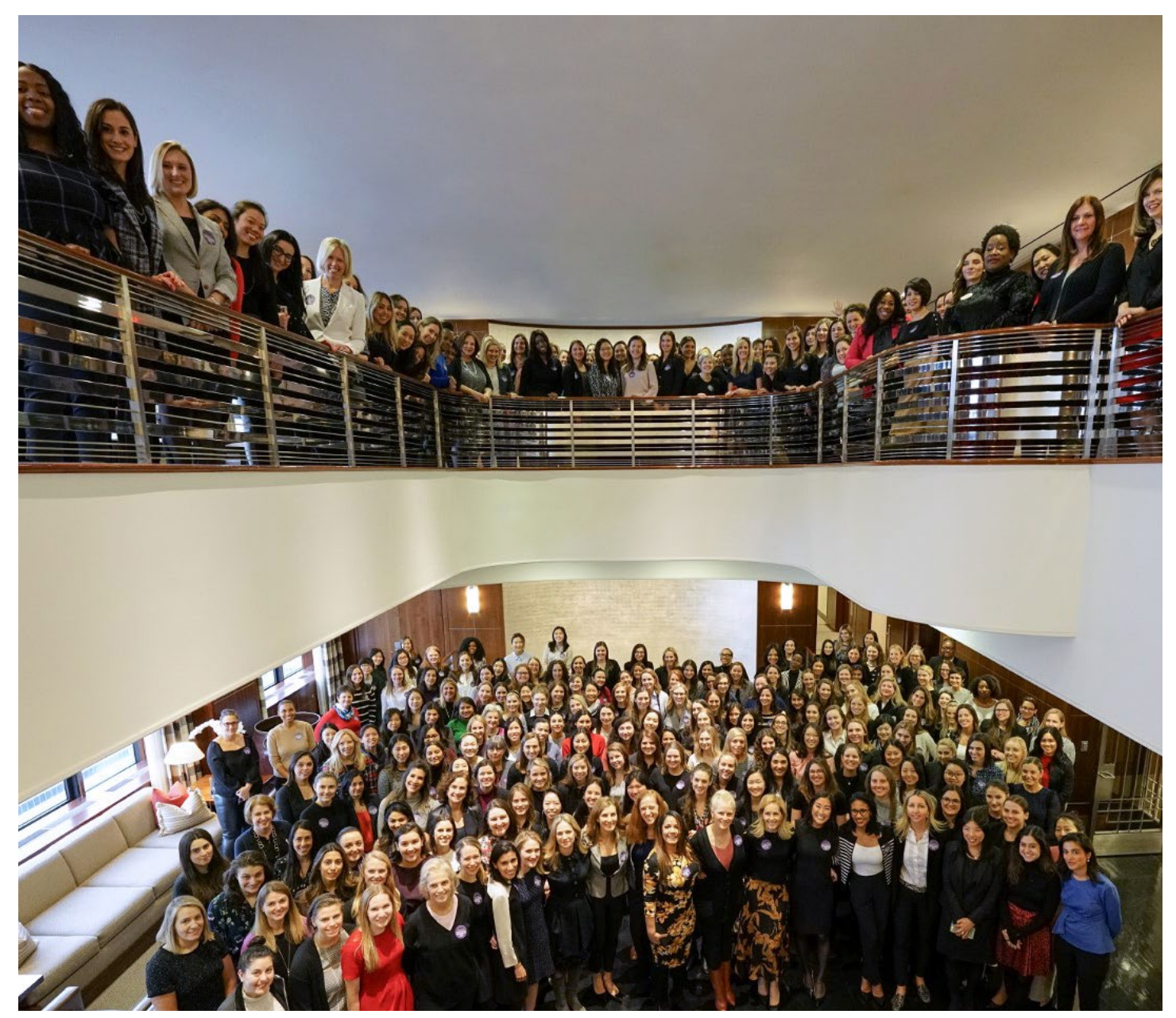
International Women's Day 2020 in lobby of Blackstone NYC Headquarters